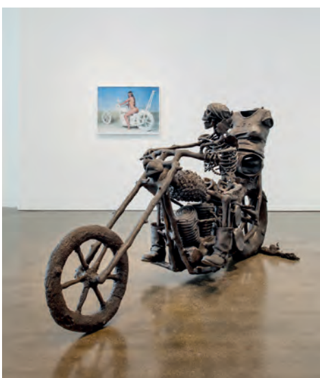
Below - Selections from the Hammer Contemporary Collection: Liz Craft installation view at Hammer Museum, Los Angeles, 2017.

AG Works like your Mountain Mamas (2003)—formless, obese, matte brown blobs, half-women half-mountains—bring together Julia Kristeva's idea of abjection as something fluid and formless, neither object nor subject, with a type of social abjection—bodies that do not function in a societally accepted way, deemed unproductive and cast away as disgusting. In that way they speak to an underbelly of society that has been deemed excludable and how social forces shape our sensations of disgust. Some of your Mamas are snow-capped mountains. What role does humor play here to deal with the abject?