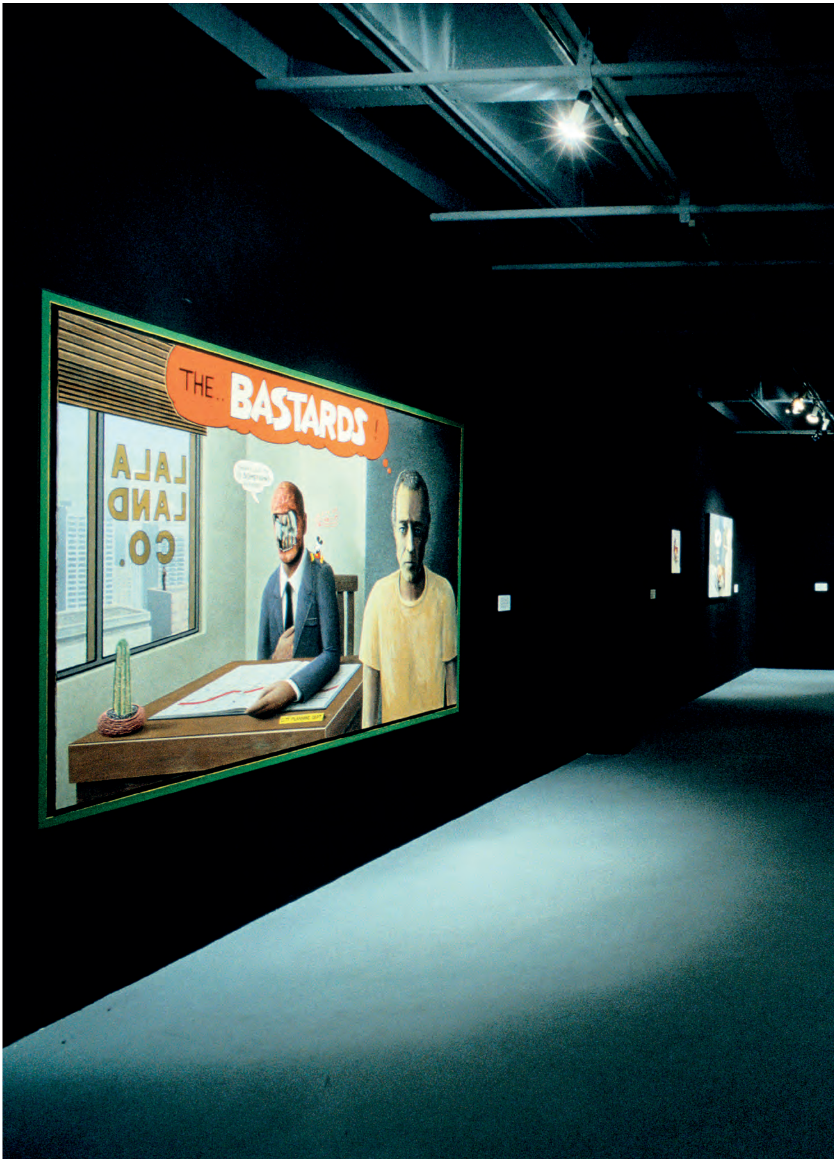
Helter Skelter: L.A. Art in the 1990s installation view at The Temporary Contemporary, Los Angeles, January 26–April 26, 1992.