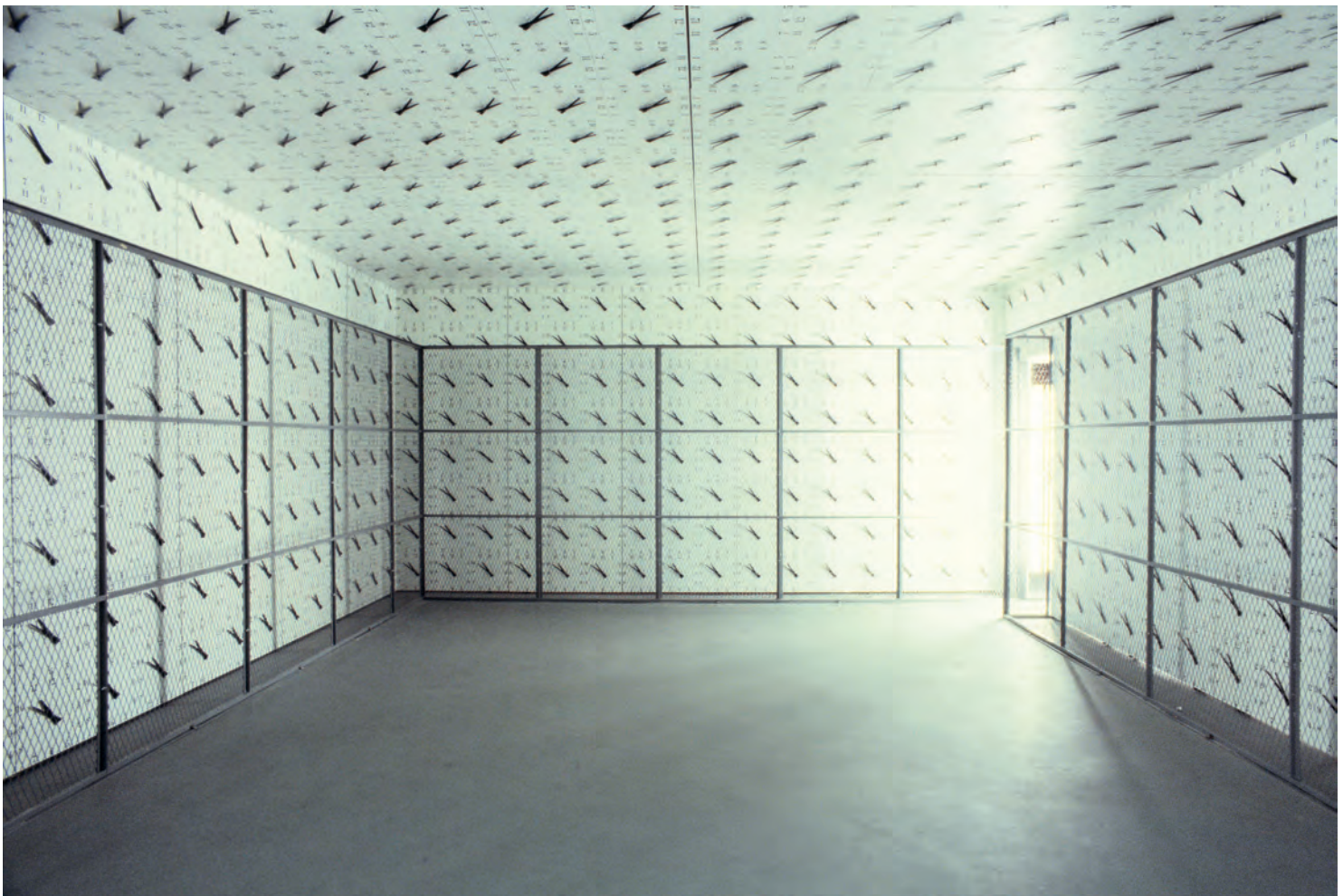
Helter Skelter: L.A. Art in the 1990s installation views at The Temporary Contemporary, Los Angeles, January 26–April 26, 1992.